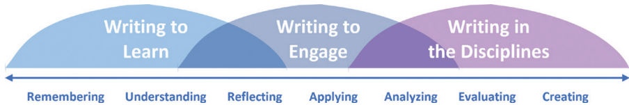
Figure 8.2. WAC activities and assignments are aligned along a spectrum of critical thinking skills.