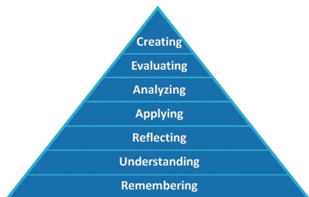
Figure 8.1. Bloom's taxonomy as modified by Anderson and Krathwohl and modified further to add reflecting as a distinct cognitive skill.

Using this modified version of Bloom's taxonomy, I've proposed a spectrum of writing activities and assignments ranging from low-stakes, writer-based writing-to-learn activities to highly rhetorical, high-stakes, genre-informed, and reader-based writing-in-the-disciplines activities. Between the ends of the spectrum, I've placed a new category of writing-to-engage activities which align with Bloom's higher-order thinking skills but do not necessarily share the characteristics of genres that commonly circulate within publication venues in a disciplinary or professional community.